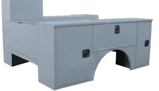
C and G Series Crane Bodies